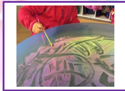
Mark making in sand