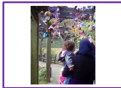
Chatting about things on our walk to the park