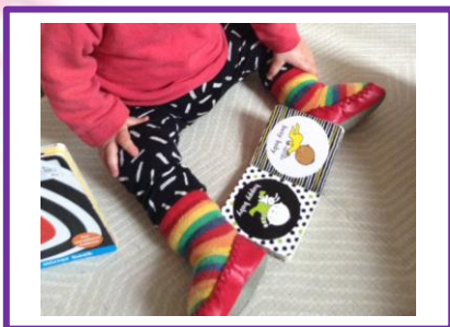
Exploring books about babies

Here are some language activities we have been enjoying recently at nursery or you have added to Tapestry.